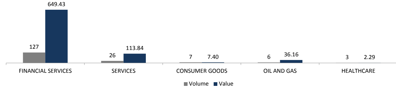
FIVE MOST ACTIVE SECTOR BY VOLUME AND VALUE ('million')