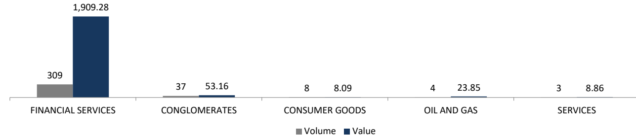
FIVE MOST ACTIVE SECTOR BY VOLUME AND VALUE ('million')