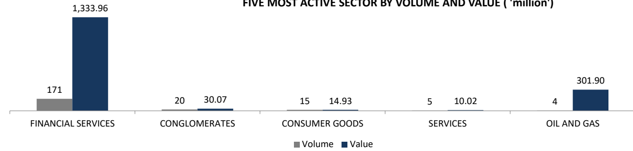
FIVE MOST ACTIVE SECTOR BY VOLUME AND VALUE ('million')