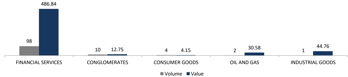
FIVE MOST ACTIVE SECTOR BY VOLUME AND VALUE ('million')